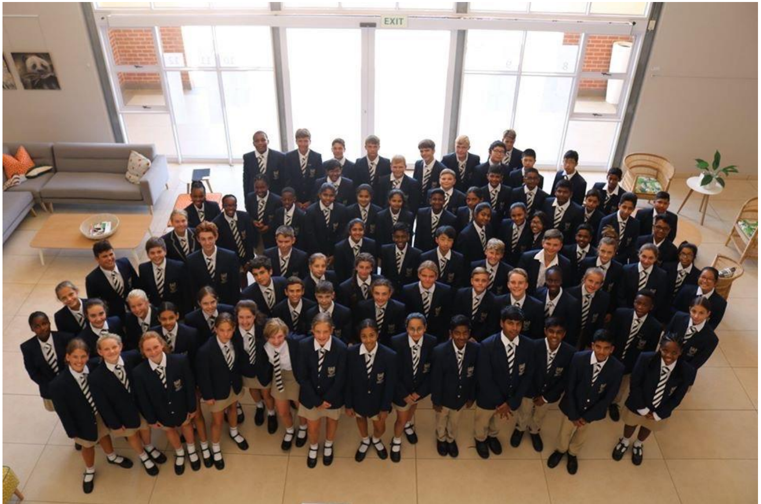
Grade 8s of 2020

Please note that these are compulsory events on our school calendar. Roll call will be taken before and after the events. More details regarding these compulsory events will be communicated closer to the time.